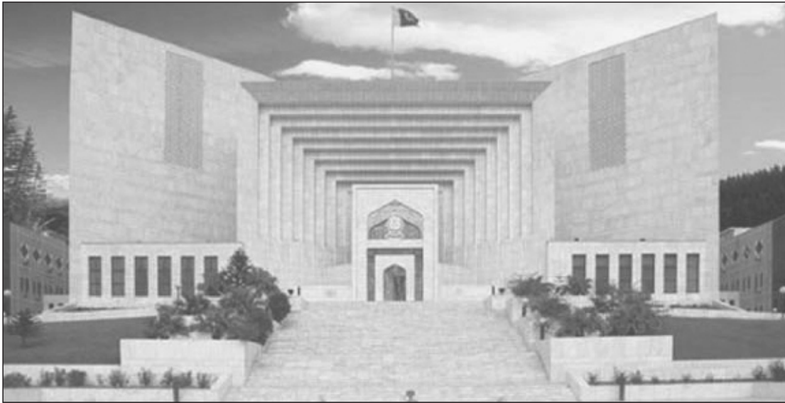
Supreme Court of Pakistan, Islamabad

Because of independent judiciary, no government can violate the law of the state. The public protect their fundamental rights through judiciary. Judiciary is the guarantor and guardian of the fundamental rights of the people. The foremost duty of judiciary is to provide justice. The courts have authority to punish the culprits or acquit the innocent after a thorough review of the cases. The higher courts of the country also hear appeals against the decisions of their lower courts. In this way, they review their decisions and give their final verdict.