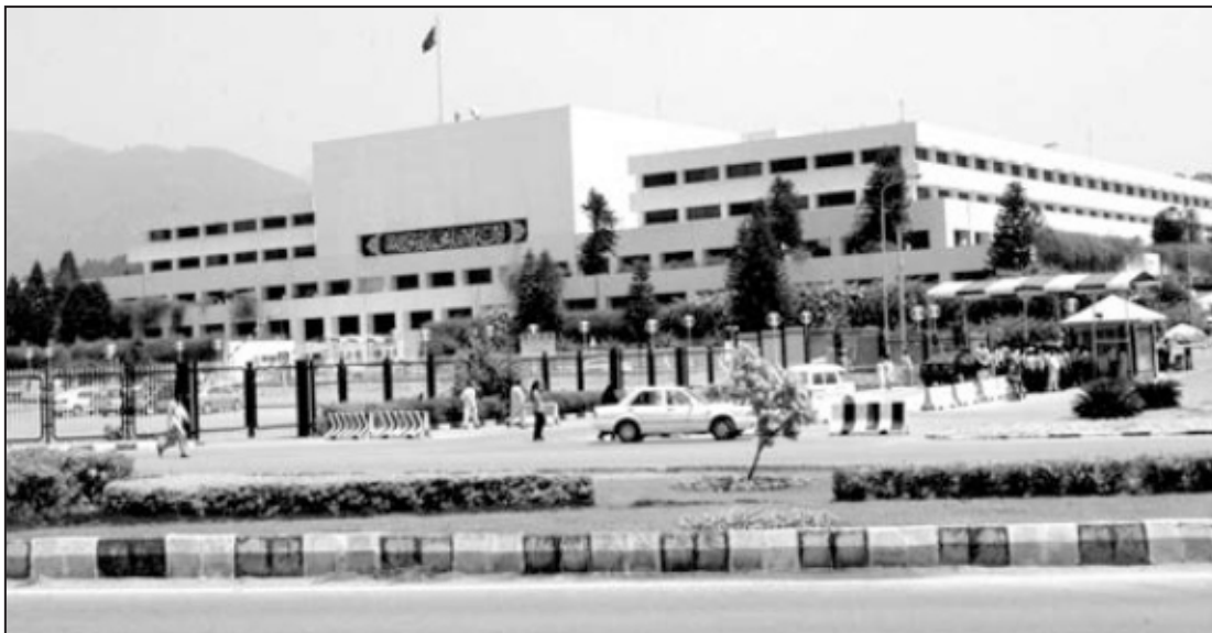
Parliament House, Islamabad

The head of the country is President of Pakistan who is elected by the members of Parliament and provincial assemblies for a period of five years. The President of Pakistan acts upon the advice of the Prime Minister, approves or returns bills passed by Parliament and may issue ordinance. The President appoints Pakistani ambassadors and receives nomination papers from foreign ambassadors. In case of any internal or external menace to the country, he can also declare a state of emergency.